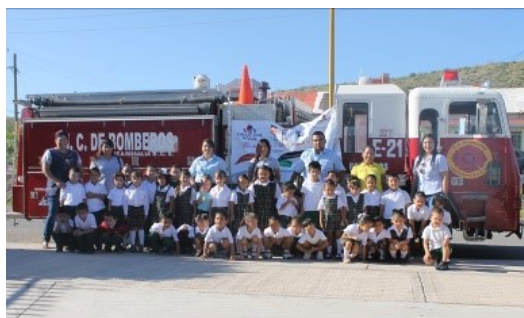
Nueva Santa Rosalia Presschool