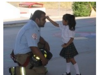
A star for great work!