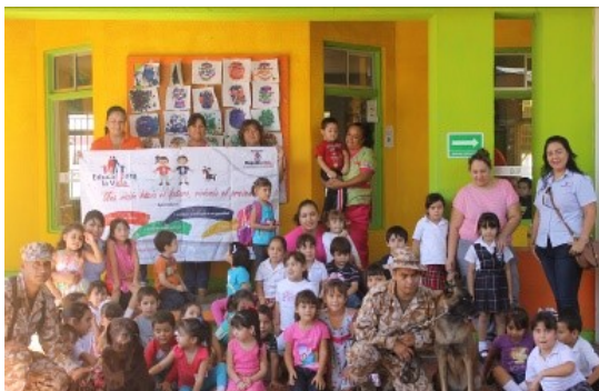
DIF Day Care Center