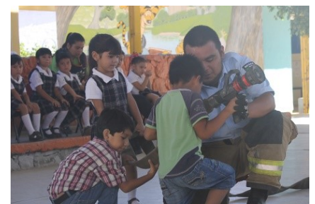
Learning an Awesome Skill